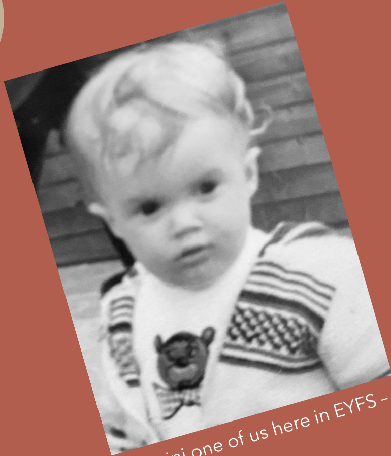
It's a mini one of us here in EYFS - but which one?

This term one of our driver subjects for the school is History. In the Early Years Foundation Stage this links brilliantly with our curriculum areas of Understanding the World, Communication and Language, and Personal, Social and Emotional Development.